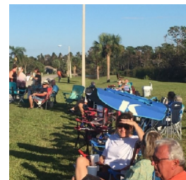
Sun and Fun