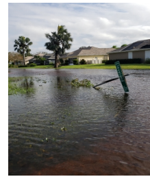
Street Signs were knocked down