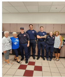
Food Was donated to First Responders