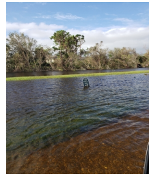
The Pond overflowed