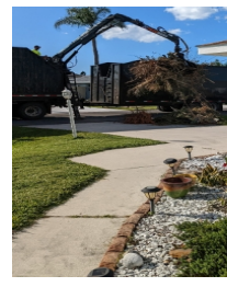
Thanks to the Debris Removal Teams