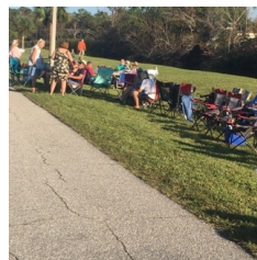
A Fun Evening