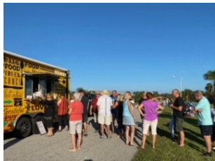
Food Truck Night