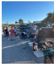
Neighbors sharing food