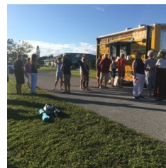
The Food Line