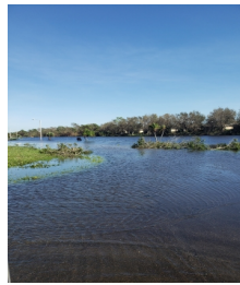
Pierce was Flooded