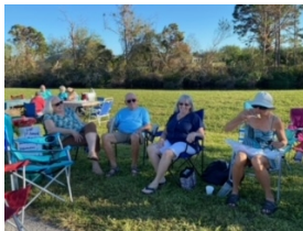
Mexican food by the pond