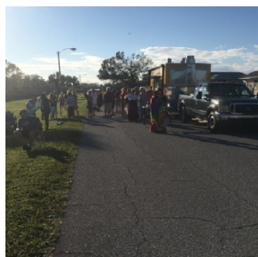
Waiting to be served