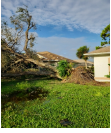
Oak Tree Down